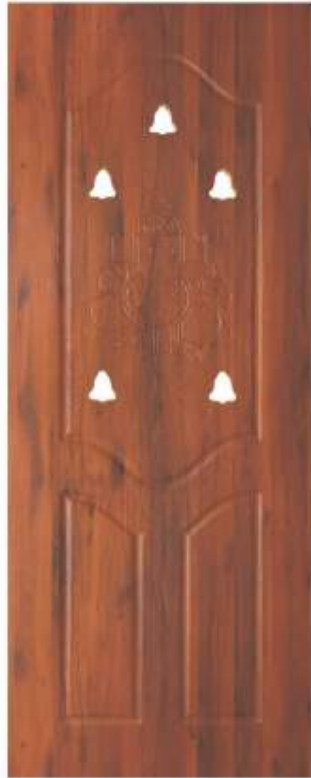
BELL - 1