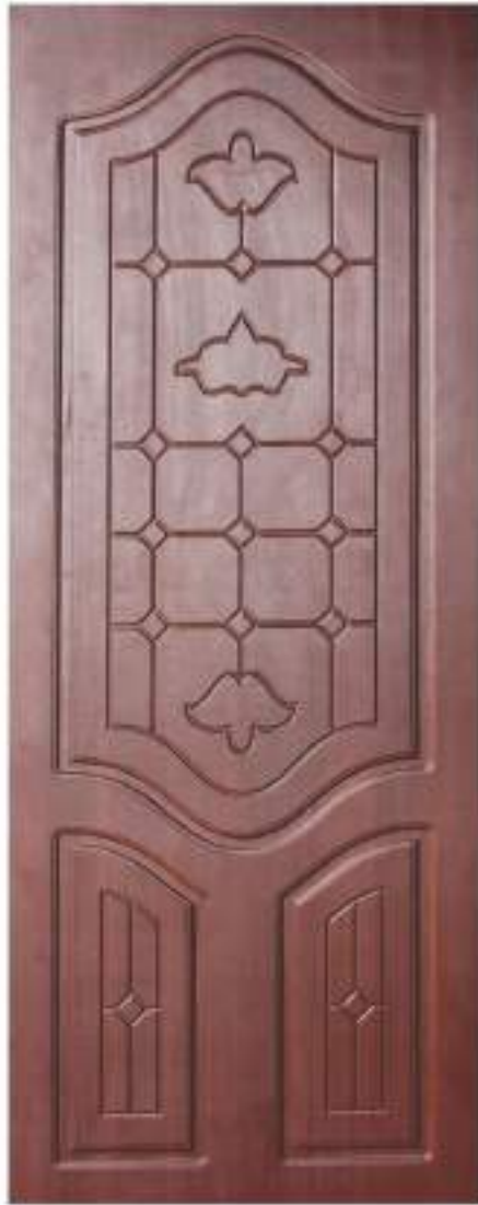
PMD - 201