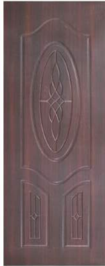
PMD - 207