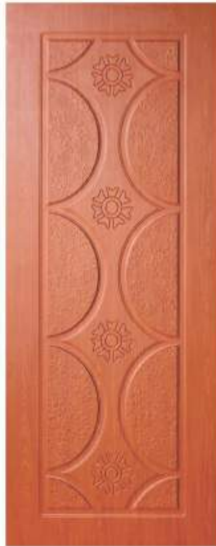
PEMD - 104