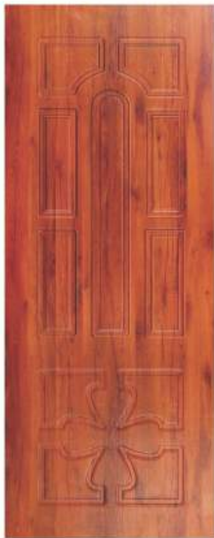
MD - 303