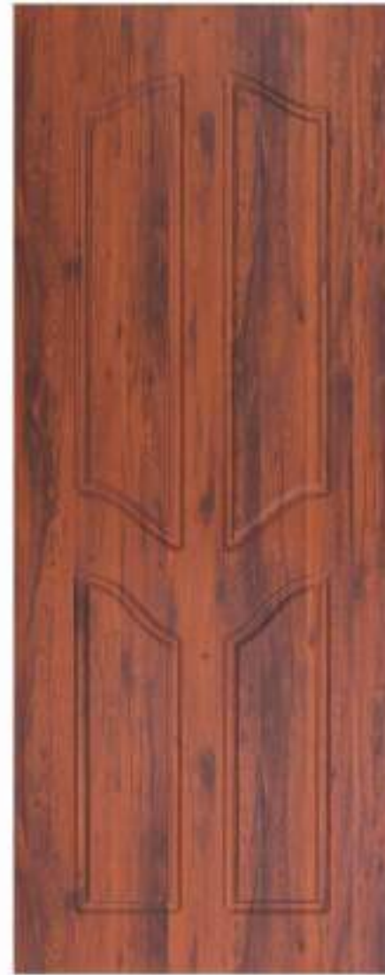
MD - 315