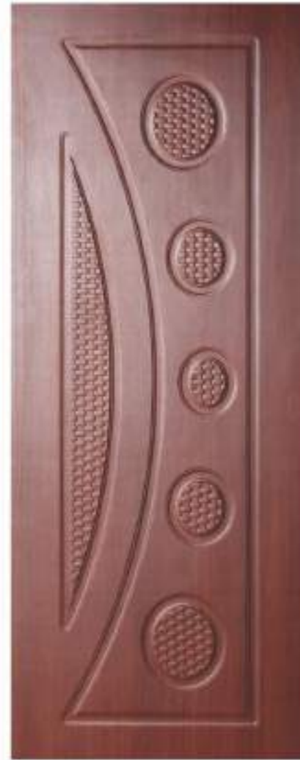
EMD - 102