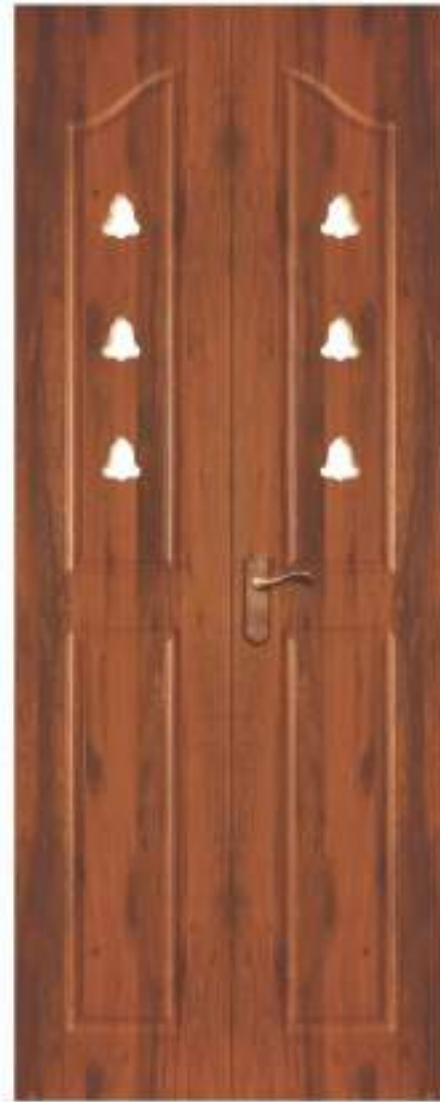
BELL - 2