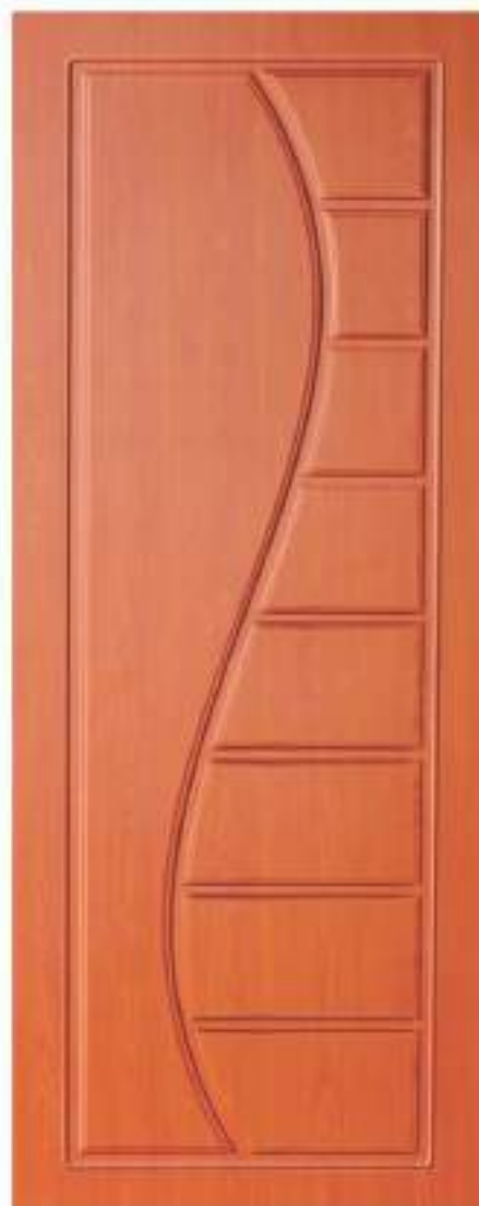
MD - 304