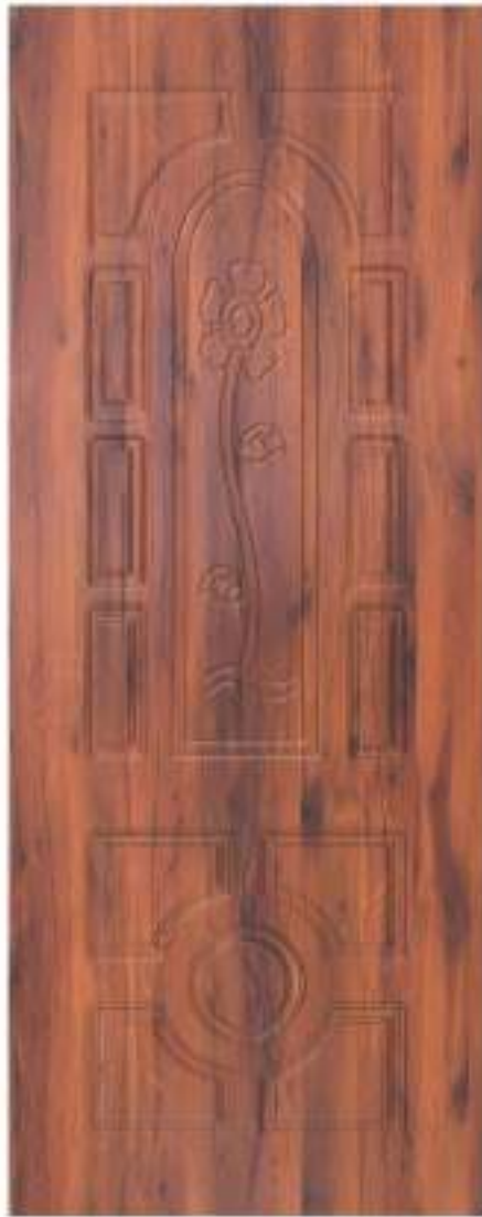
PMD - 210