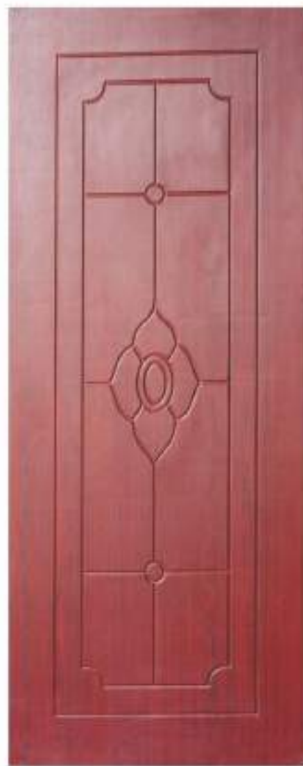
MD - 301