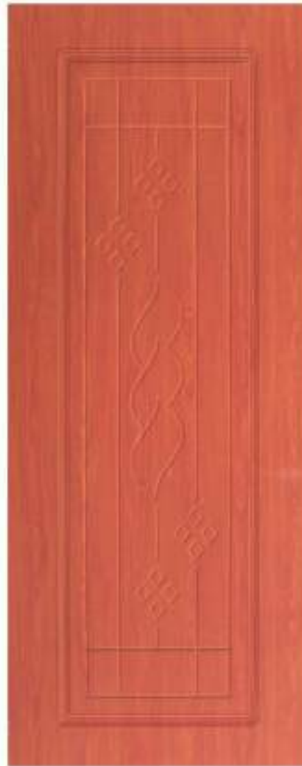
PMD - 206