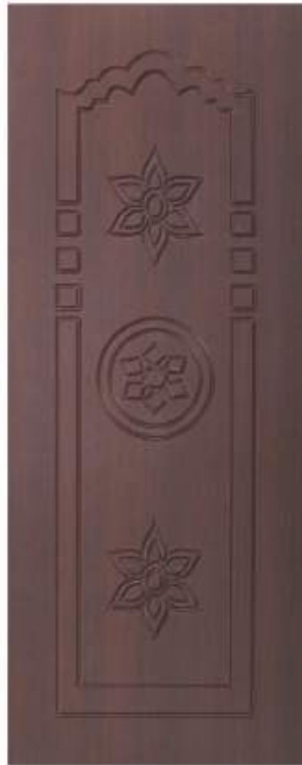
MD - 314