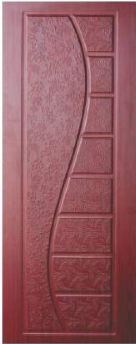
PEMD - 101