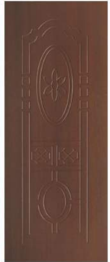
MD - 316