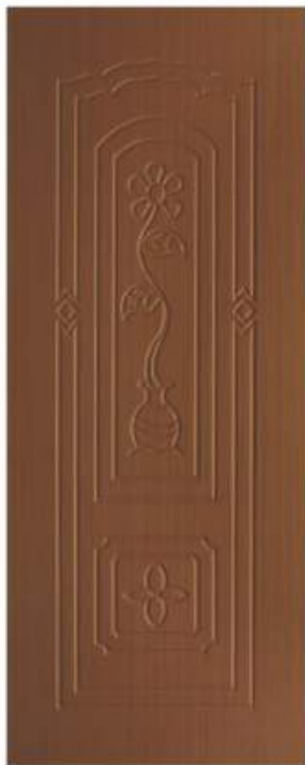
PMD - 214