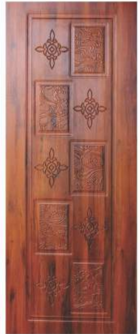
EMD - 103