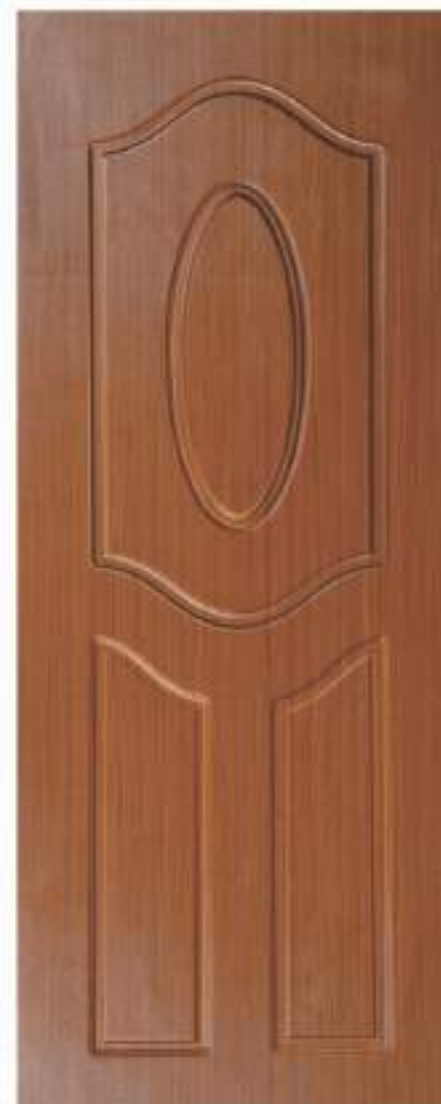
MD - 302