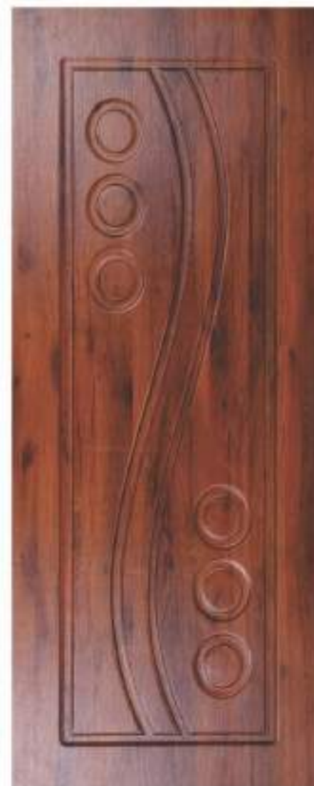
MD - 307