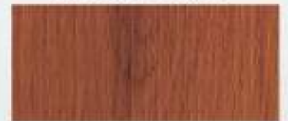
A - Teak