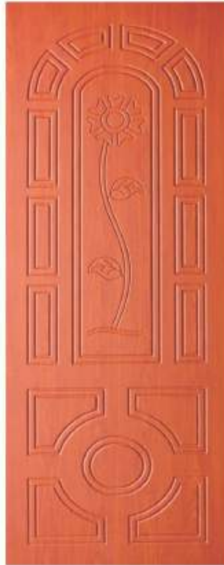
PMD - 202