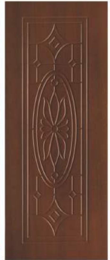
PMD - 213