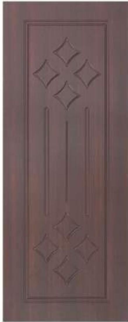
PMD - 205