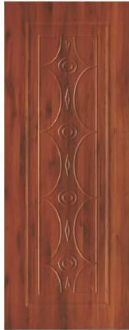
PMD - 212