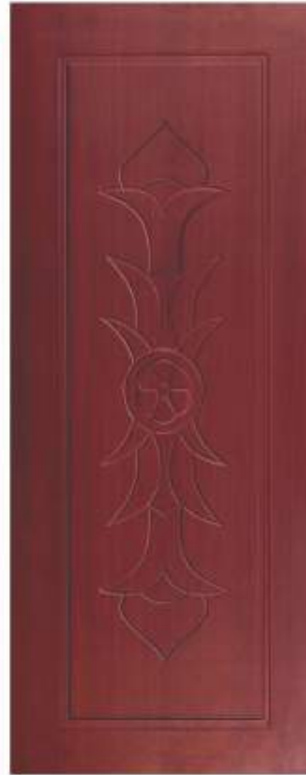
PMD - 203