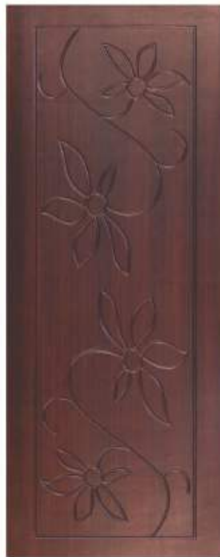
MD - 305