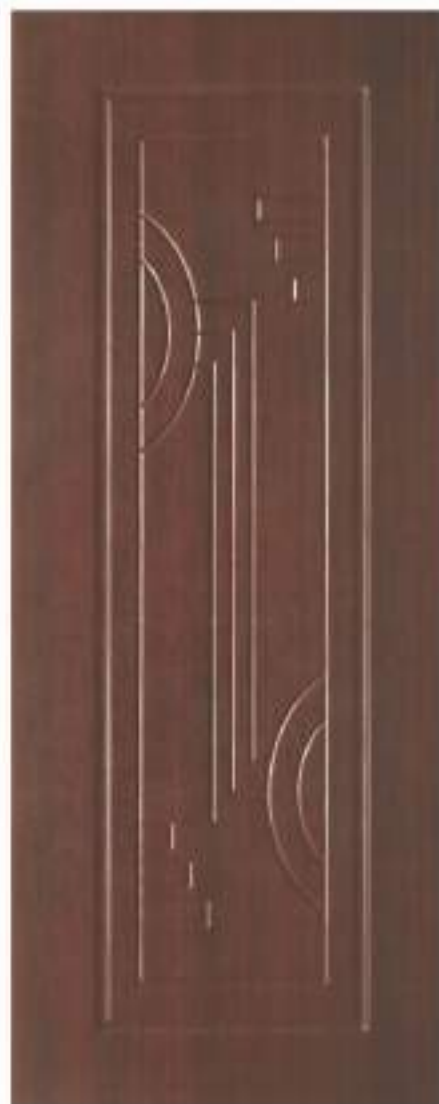
PMD - 215