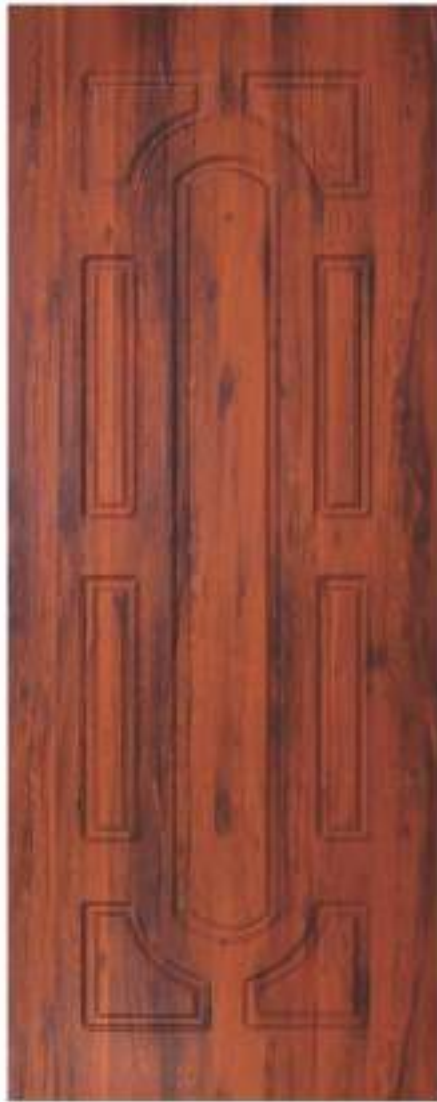
MD - 313