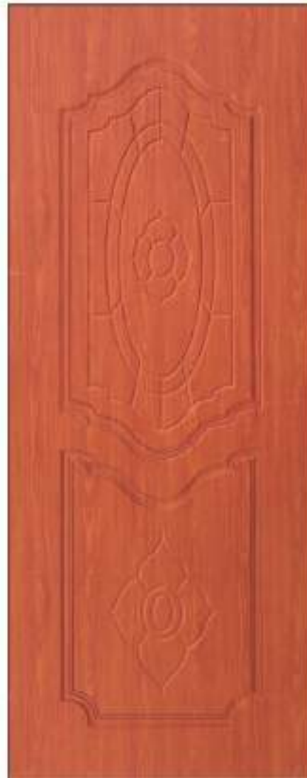
PMD - 211