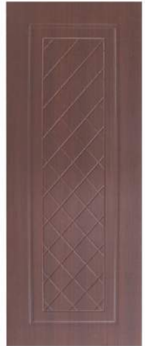
PMD - 209