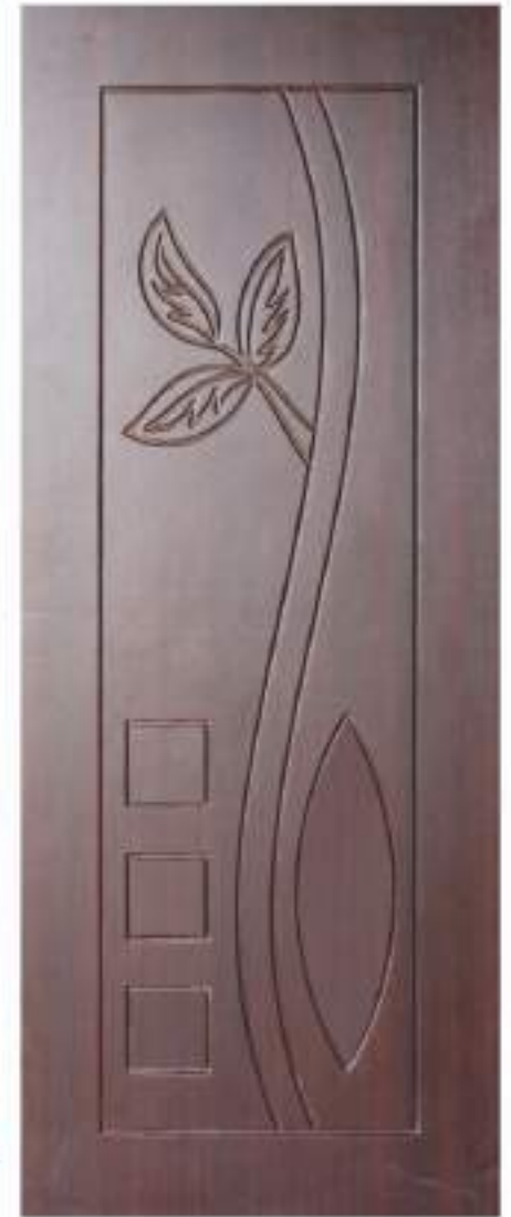
PMD - 204